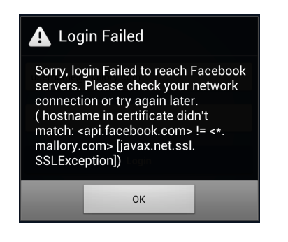
Figure 3: Facebook's SSL warning.

During manual analysis, we also found that 53 apps that were not vulnerable to our MITM attacks did not display a meaningful warning messages to the user under attack. These apps simply refused to work and mostly stated that there were technical or connectivity problems and advised the user to try to reconnect later. There was also an app that recommended an app-update to eliminate the network connection errors. Some apps simply crashed without any announcement. Figure 2 shows a confusing sample error message displayed during a MITMA.