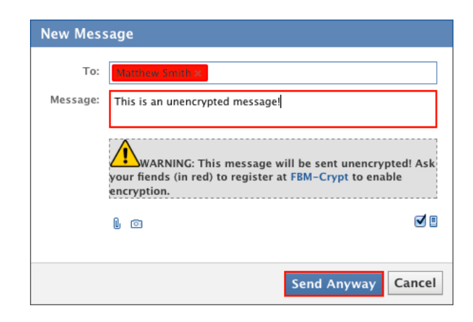
Figure 3: The modified message composer in case a message will be sent unencrypted.

The FBMCrypt plugin automatically checks if the recipients of a message are registered with the FBMCrypt service. If they are not, the message cannot be encrypted and can only be sent in the clear. We modified the message composer to make the user aware of an unencrypted message exchange, as illustrated in Figure 3.