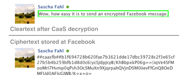
Figure 4: Cleartext and ciphertext of a FBMCrypt protected message

A more detailed technical description of the confidentiality as a service backend and the encryption mechanism as well as a security discussion can be found in [7, 8]. The following focuses mainly on the usability aspects of the message protection mechanism.